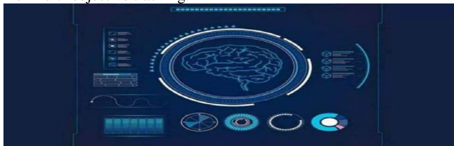
Figure 3 Internet + artificial intelligence