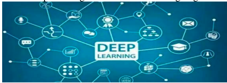
Figure 2 Corresponding research

find that this new single target tracking algorithm has a very significant tracking effect, and can accurately locate the tracking target in each frame. Compared with the traditional single target tracking algorithm, it can be found that this new single target tracking algorithm and tracking concept can play a good role in promoting the research of tracking targets.